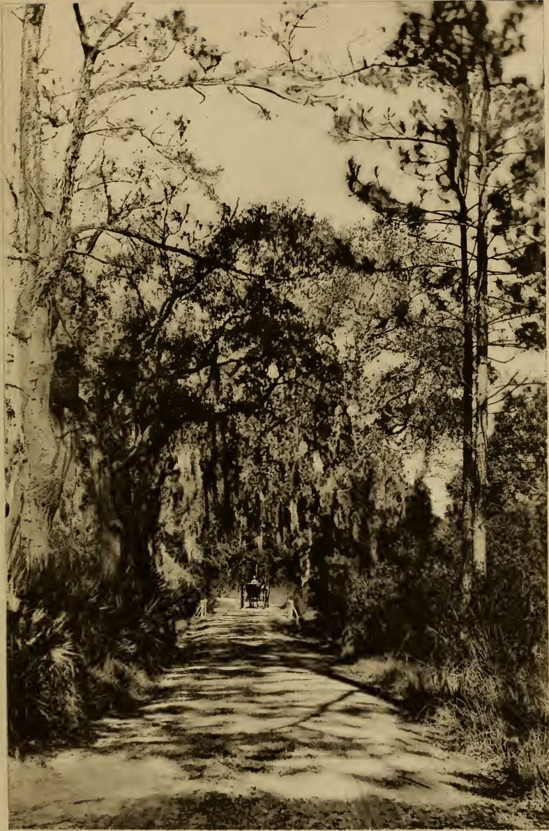
JESSAMINE ROAD AT OLD GOLF COURSE